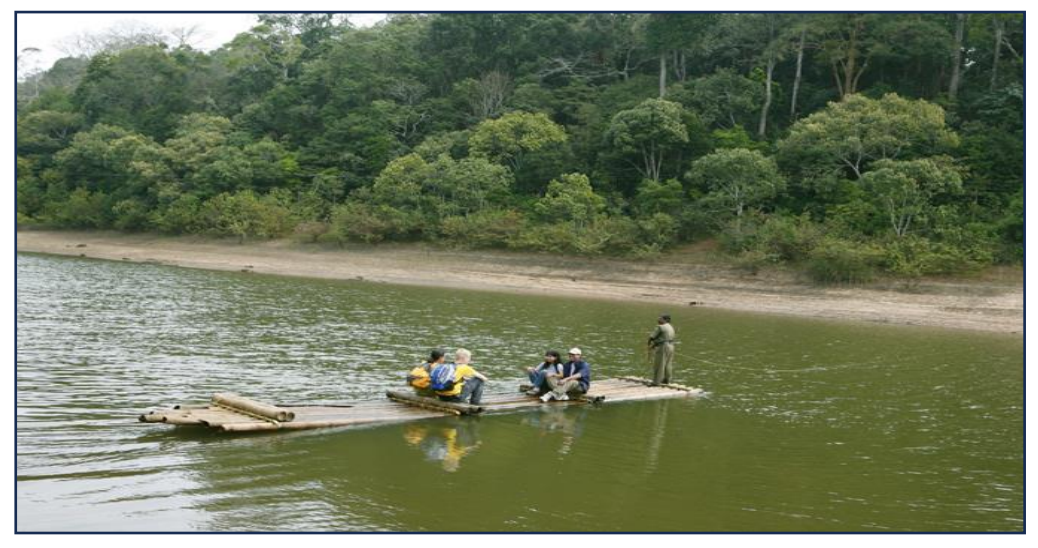
Periyar Wildlife Sanctuary

The wildlife sanctuary was declared a tiger reserve in 1978. The splendid artificial lake formed by the Mullaperiyar Dam across the Periyar River adds to the charm of the park. The greatest attractions of Periyar are the herds of wild elephants, deer and bison that come down to drink in the lake. The sanctuary can be accessed through a trekking, boating or jeep safari. Thekkady is considered a haven for natural spices such as black pepper, cardamom, cinnamon, nutmeg, mace, ginger, and clove