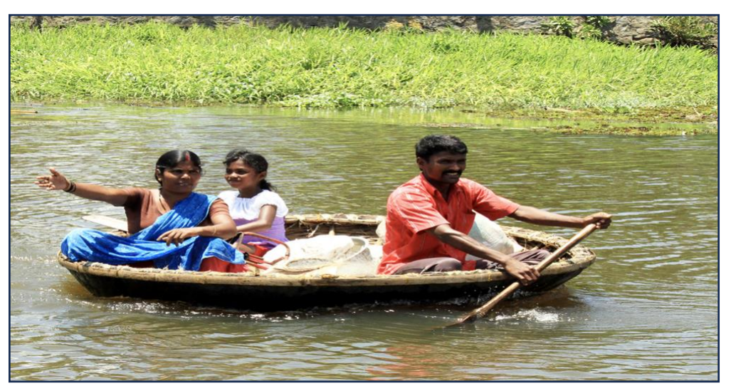
On Lake Vembanad