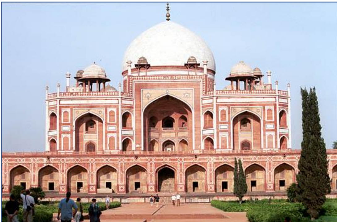
Humayun's Tomb, Delhi

On arrival, you will be met and transferred to your hotel.