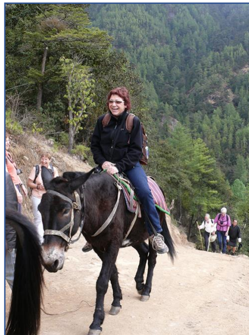
Taktsang (Tiger's nest) and the easy option

Then visit Kyichu Lhakhang, one of the oldest and most sacred shrines of the country.